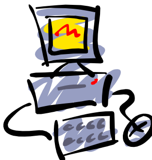
Quarterly Newsletter of Vale Royal Athletic Club